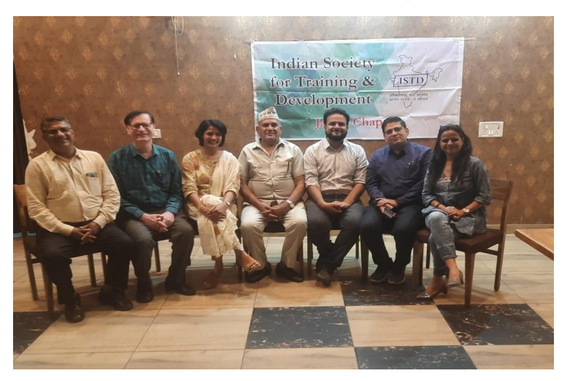
15<sup>th</sup> Aug Celebrartion