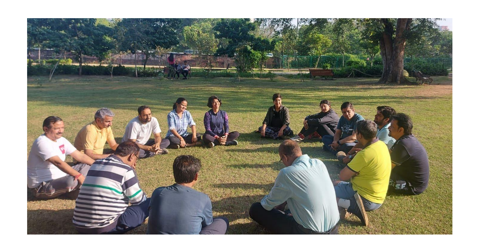
Bharatpur Training Program